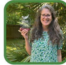
Holly Hunt Distinguished Service Award